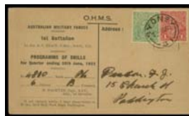
Ex Lot 231