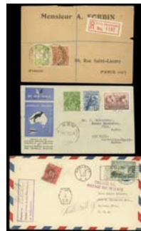
Ex Lot 217