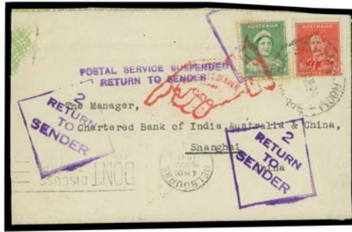
Ex Lot 214