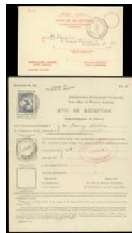
Ex Lot 227