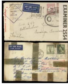
Ex Lot 240

Lot Type Grading Description Est $AUD 240 C B/C 1945 cover via United States to Sweden with 'OAT' h/s applied at London, Australian & British censor tapes, minor toning; also 1954 "Belfast" crash cover unusually to India with the red cachet applied at Singapore & repaired with "sticky" tape. (2) 100T