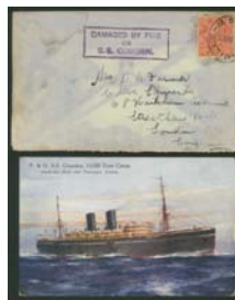
Ex Lot 233