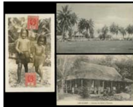
Ex Lot 824