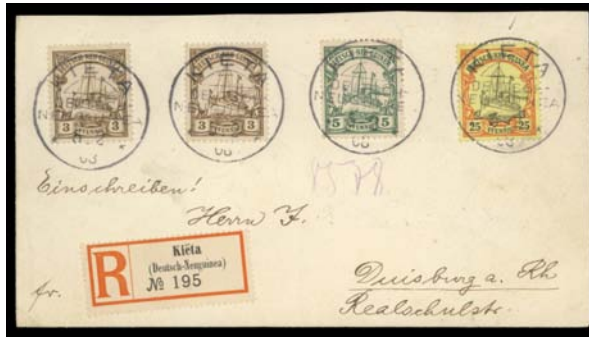
Ex Lot 895