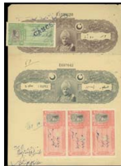
Ex Lot 865