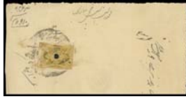
Ex Lot 854