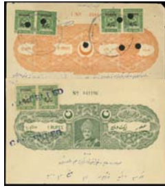
Ex Lot 867