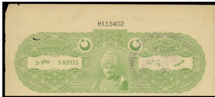
Ex Lot 869