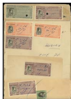
Ex Lot 866