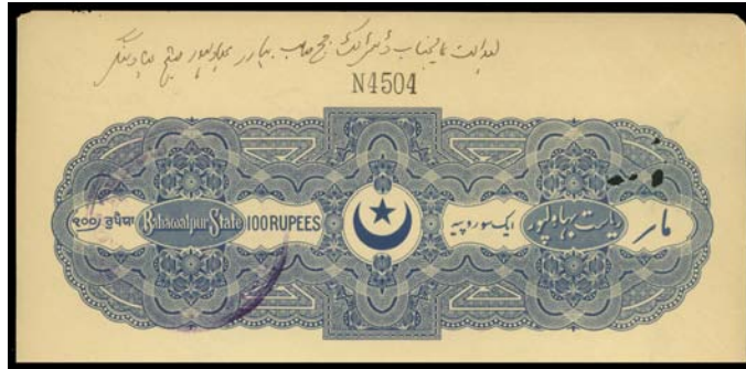
Ex Lot 868