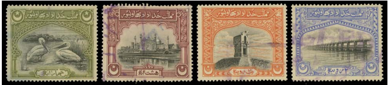
Ex Lot 856