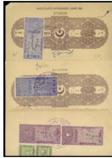
Ex Lot 855