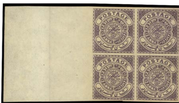
Ex Lot 874