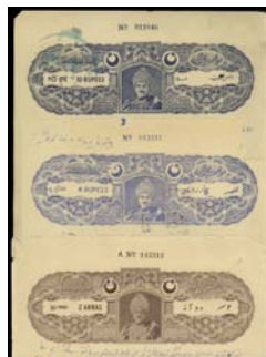
Ex Lot 870