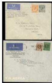
Ex Lot 883

882 CPS Handy group including FMS 1933 15c Registration Envelope to England, 1941 Straits with FPO cds & boxed 'PASSED BY/NAVAL/CENSOR' h/s, 1941 Johore-Ireland by air, Japanese Occupation piece from a locally used wrapper & Selangor 15c Registration Envelope (flap fault) with Kanji Overprint used Syonan to Teluk Anson, etc, condition variable. (9) 300T