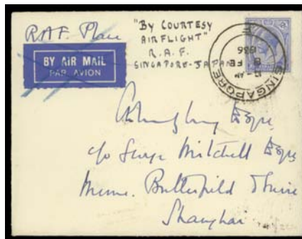
Ex Lot 885