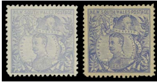
Ex Lot 360

360 * A/B 1905-12 Crown/A-in-Circle 20/- Carrington Perf 11 BW #N77 (SG 350), virtually full o.g. & very fine; also Perf 11x12 BW #N79 (SG 350b), one short perf & minor aging; Cat $700 (£380). (2)