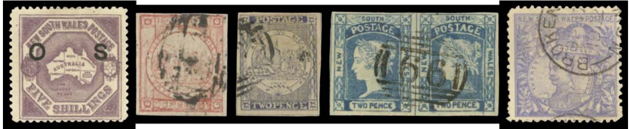
Ex Lot 341