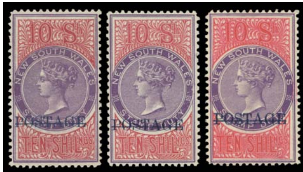
Ex Lot 357