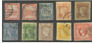
Ex Lot 339