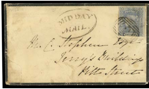
Ex Lot 365