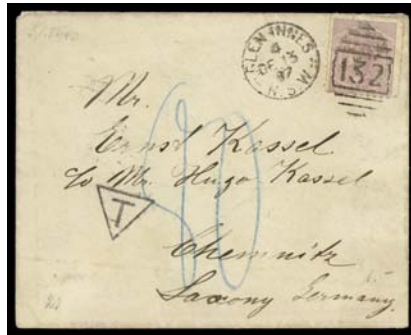
Ex Lot 366