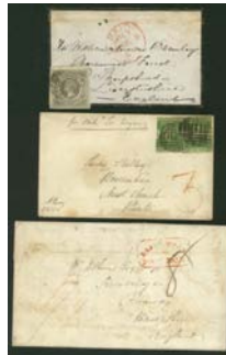
Ex Lot 367