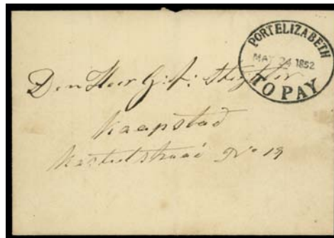
Ex Lot 981

981 C B CAPE OF GOOD HOPE: 1852 & 1853 outers with forgeries of the oval 'PORT ELIZABETH/MAY 24 1852/TO PAY' d/s (superb!) & 'PORT ELIZABETH/AUGT 29 1853/PAID' d/s (fine). (2)