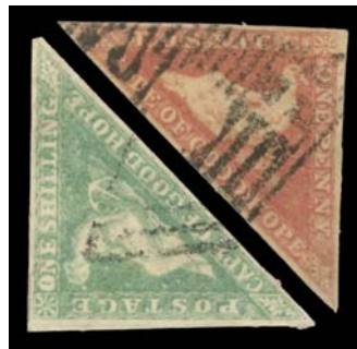
Ex Lot 980

980 O A/A- CAPE OF GOOD HOPE: Triangles comprising 1855-63 Perkins Bacon 4d, and 1863-64 De La Rue 1d, 4d (2, one just touched at lower-right) & 1/- emerald (tiny scissor-cut in margin at lower-right), full margins, Cat £835. (5)