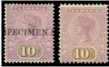
Ex Lot 603