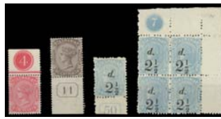
Ex Lot 604