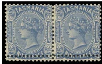
Ex Lot 605