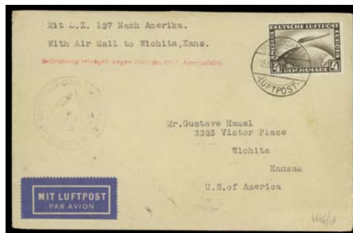
Ex Lot 36