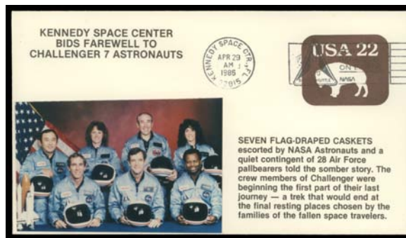
Ex Lot 35