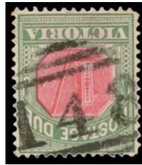
Ex Lot 725