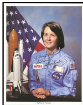
Ex Lot 70