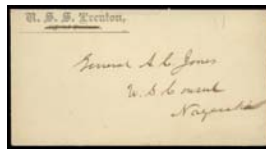
Ex Lot 1002