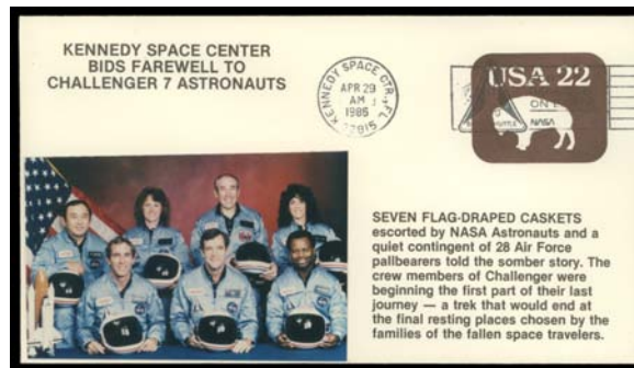
Ex Lot 35