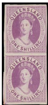
Ex Lot 266

266 P A 1860-61 Small Star imperforate plate proofs 3d single in brown & 1/- vertical pair in violet on ungummed unwatermarked wove paper, margins close to good with complete outer framelines. (2 items) 600T