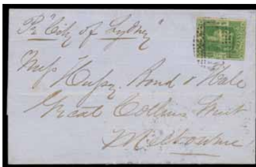
Ex Lot 356