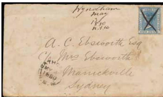
Ex Lot 361

360 C A+ 1853 cover to Newcastle with a superb example of the Laureates Plate 3d Prussian blue struck with light BN '64' of 'WEST MAITLAND' (crowned-oval b/s), arrival d/s of OC*7 on the face, endorsed "Unclaimed" in red & with another strike of the Newcastle d/s of NO*8, sent to the DLO with Sydney b/s of NO*9 and the unusual 'ADVERTISED/UNCLAIMED.' h/s (with the lower line tilted backwards). Superb! [With the original merchant's enclosure] 800