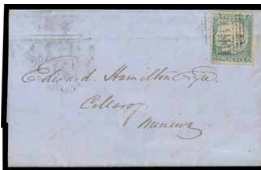
Ex Lot 358