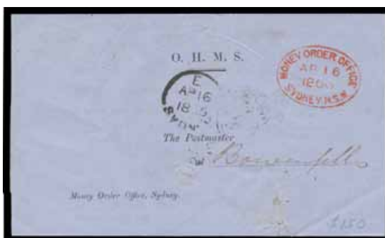
Ex Lot 357