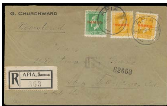
Ex Lot 48