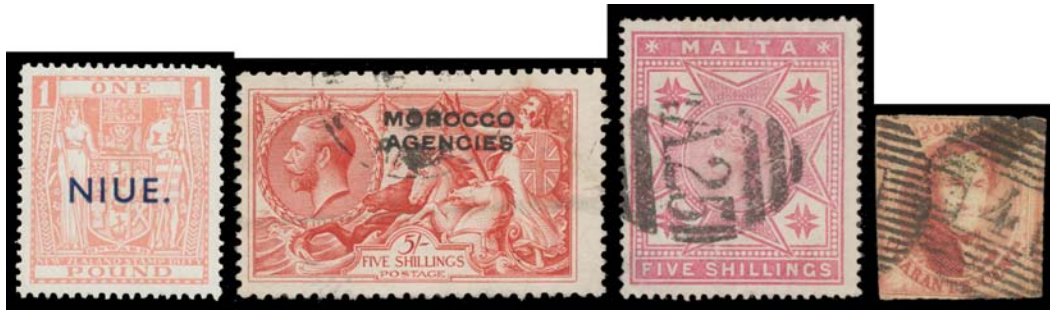
Ex Lot 56