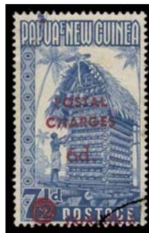
Ex Lot 57