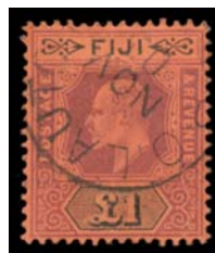
Ex Lot 10