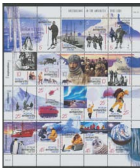
Ex Lot 59