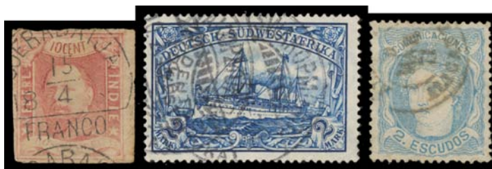
Ex Lot 61