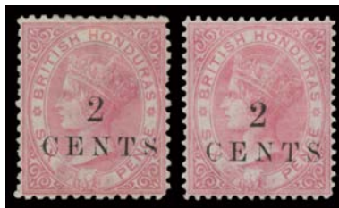
Ex Lot 5