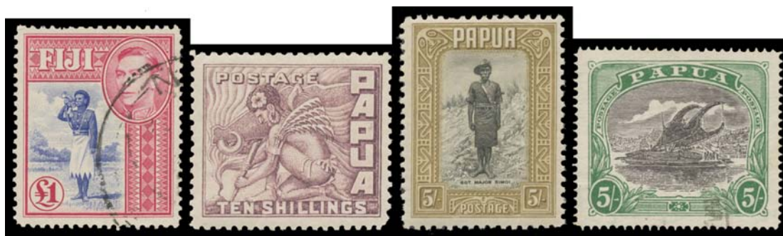
Ex Lot 44