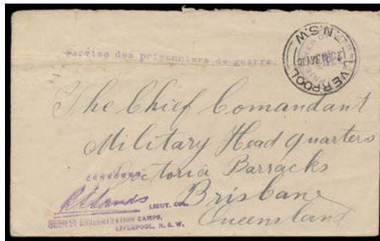
Ex Lot 17