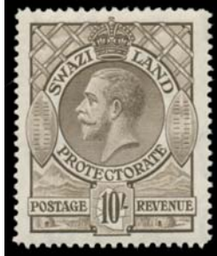
Ex Lot 3