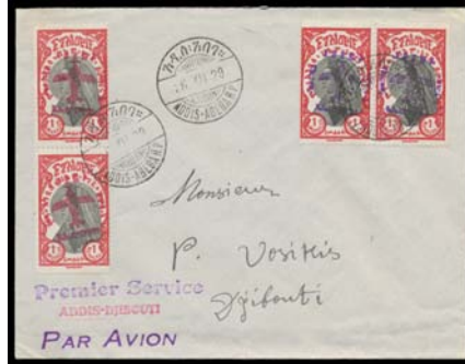
Ex Lot 39