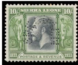
Ex Lot 9