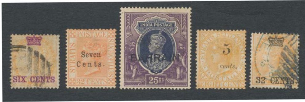
Ex Lot 7