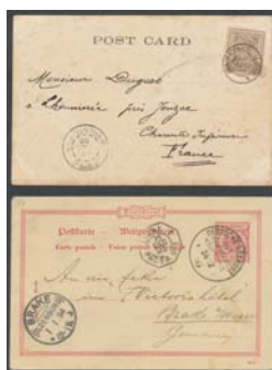
Ex Lot 49