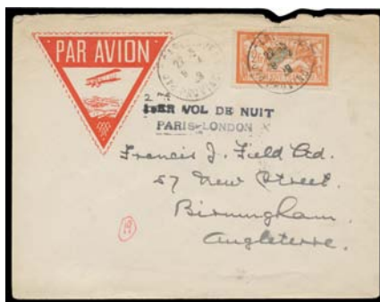
Ex Lot 30