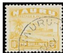
Ex Lot 6