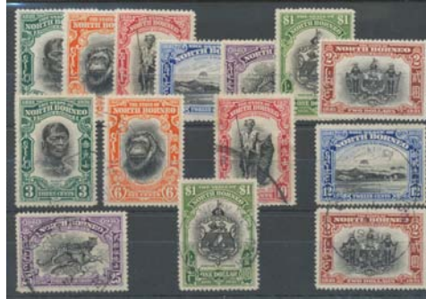
Ex Lot 897

896 P A 1931 Golden Jubilee perforated singles from the printer's sample sheets with the frames in unissued colours comprising 3c purple, 6c violet, 25c brown & $2 olive, each with 'WATERLOW & SONS LTD/SPECIMEN' opt & small security punch, variable centring. (4) 400T