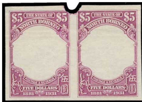
Ex Lot 895

894 P A 1931 Golden Jubilee imperforate plate proofs of the 3c to $5 frames only in the issued colours, the 25c with red-ink audit mark, each with security punch into the design. (8) 800T