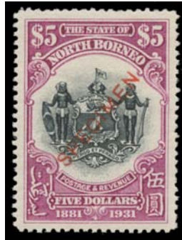
Ex Lot 898

897 *O A B1 1931 Golden Jubilee 3c to $2 SG 295-301 mint & used (various cancels), Cat £420+. (14) 275T