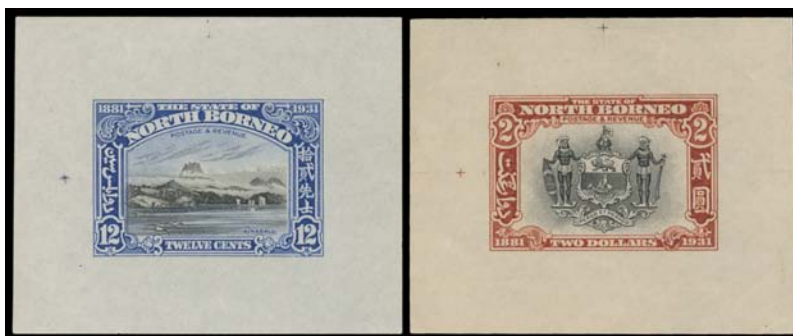
Ex Lot 893

892 **O **O Arms including forgeries, 1947 Overprints 50c Lower Bar Broken at Left *, QEII 1954 Pictorials used to $5 x3 including 50c Watermark Inverted (Cat £325), 1961 Pictorials to $5 x2 used, Japanese Occupation 1942 Surcharges 2c & 3c * & 1944 Overprints 2c corner block of 4 CTO; Labuan 1902 Arms set *; Sarawak 1945 BMA Overprints set ** (toning, $10 creased); etc., condition generally fine, Cat £1500+. (100s) 600