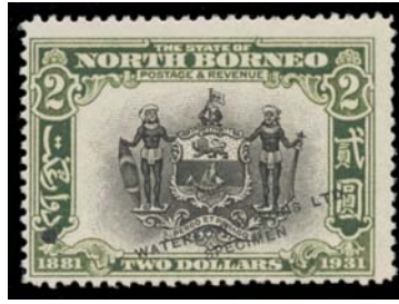
Ex Lot 896

896 P A 1931 Golden Jubilee perforated singles from the printer's sample sheets with the frames in unissued colours comprising 3c purple, 6c violet, 25c brown & $2 olive, each with 'WATERLOW & SONS LTD/SPECIMEN' opt & small security punch, variable centring. (4) 400T