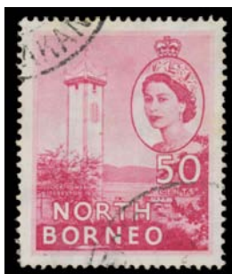
Ex Lot 892

892 **O **O Arms including forgeries, 1947 Overprints 50c Lower Bar Broken at Left *, QEII 1954 Pictorials used to $5 x3 including 50c Watermark Inverted (Cat £325), 1961 Pictorials to $5 x2 used, Japanese Occupation 1942 Surcharges 2c & 3c * & 1944 Overprints 2c corner block of 4 CTO; Labuan 1902 Arms set *; Sarawak 1945 BMA Overprints set ** (toning, $10 creased); etc., condition generally fine, Cat £1500+. (100s) 600