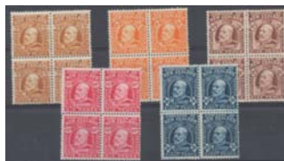
Ex Lot 882

882 */** A/A- 1908-16 Perf 14x14½ KEVII 3d chestnut, 4d orange-yellow, 5d brown, 6d carmine & 8d indigo-blue in blocks of 4, the lower units of each block unmounted, some hinge remainders on upper units, Cat £388+. (5 blocks) 250T