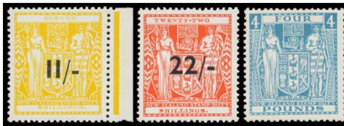
Ex Lot 887

887 * A/B POSTAL FISCALS: 1940-58 Arms Surcharges comprising '3/6d' on 3/6d (3), '5/6d' on 5/6d (3), '11/-' on 11/- (4), '22/-' on 22/- (3, SG F190, F216 & F216w), also £4 light blue SG F210, a few with gumside ink annotations but generally fine, Cat £2200+. (14)