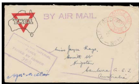
Ex Lot 734