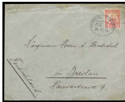
Ex Lot 647

636 C A CAROLINE ISLANDS: 1912 philatelic cover to Germany, 20pf with manuscript cancellation "1 4 12/Kusse" & tied by straight-line 'RDS DELPHIN' in violet. Very attractive & illustrated by Friedemann at page 792 but adjudged by him to be an unauthorised confection. 0T