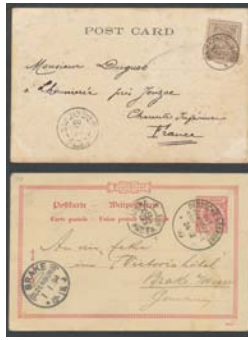
Ex Lot 49

49 CPS Postcards with ship mail cancels comprising German Schiffspost No 25 from Singapore, No 43 from Hong Kong & No 65 from China & from Singapore, '.../OST-/ASIATISCHE/HAUPTLINIE' from Port Said also with 'LIGNE T/PAQ FR No1' d/s, 'LIGNE N/PAQ FR No2' from Shanghai & as a cancel on Straits 3c from Singapore, condition variable. (7)