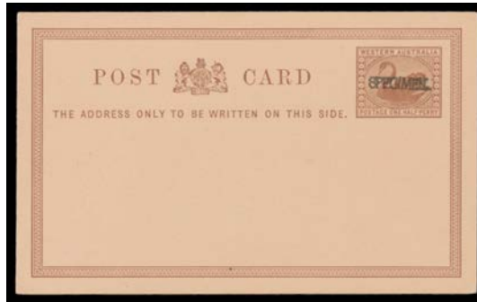
Ex Lot 321

321 PS 1879-92 Half-Penny annotated study on 12 pages including Post Office band (front only) for 12 cards, PC1 with 'SPECIMEN.' h/s, "Dies" as per Pope & Thomas x11, early usage of JA29/1880 with electoral advert, PC6 on White with 'NOT KNOWN/BY LETTER CARRIERS' h/s, PC7 in Sepia/White unused x2 & uprated to Victoria, 1903 Post Office Emergency Issue with ½d stamp affixed below used to New Zealand, etc, generally fine to very fine. (20)