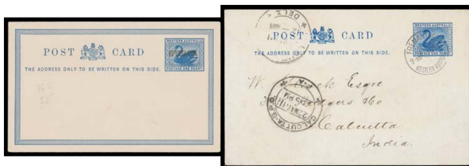
Ex Lot 325

325 PS 1879-1910 Penny annotated study on 42 pages including Post Office band (front only) for 12 cards, PC1 with 'SPECIMEN.' h/s, "Dies" as per Pope & Thomas x16, 1902 to NSW redirected to New Zealand, 1894 & 1900 taxed cards to GB & Germany, 1886 irregular usage in GB & taxed; "Melbourne Zinco" PC8 unused x2, 1903 DLR Stereos Used in Melbourne PC9 unused & used x3; "Available only for the Commonwealth..." PC 10A used x3 & with 'NY' Flaw PC10B unused & used x4 (one a new ERU of MR3/04); "Available only for the United Kingdom..." PC13 unused & used x9 (one the ERU of NOV23/1905, one to Singapore); 1907 Original Design Melbourne Printings PC15 unused x2 & used x4 (one to the USA & taxed); Unbordered Issues Unsurfaced PC17 unused x2 (one unusually without Burns Philp address) & used x2, and Surfaced PC18 unused x6 (one noted as "Rare Thick Card") & used x5 (one to India), etc; some postmark interest, condition variable but generally good to very fine. A very good lot. [Includes a comparison of PC18 cards based on Mogens Juhl's description of the "Handpainting Card", & varying height of the Coat-of-Arms in relation to the stamp] (73)