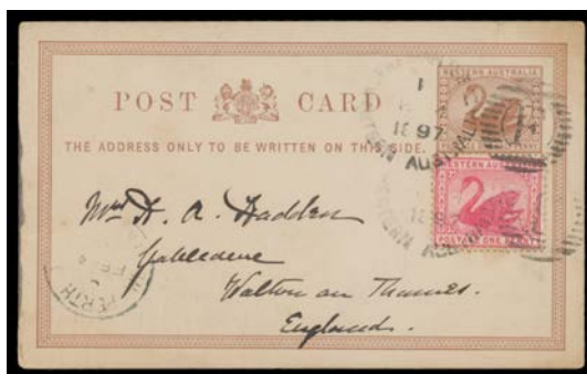
Ex Lot 324

324 PS A-/B 1879 1d blue PC2 to Germany in 1897 uprated with 1d tied by KGS duplex, & to London in 1899 uprated with 2d grey, also ½d brown/white PC6 to England in 1897 uprated with 1d, a few minor blemishes, all apparently commercial. A very scarce trio. [The 1892 Regulations allowed for the uprating of Postal Cards with a ½d stamp only. All other upratings in the Colonial Period were thus contrary to the Regulations] (3)