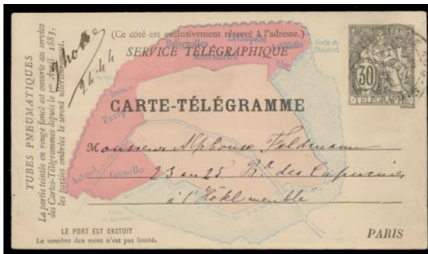
Ex Lot 20

20 CPS Accumulation of world covers etc with Great Britain bundle including pre-stamps, 1844 stampless to NSW, 1869 to India with 1d & 1/- and small oval 'SEA POST OFFICE' b/s, 1/2d green Wrapper uprated with Bantam 1/2d, 1890 Penny Postage 1d Envelope used, 1934 River Findhorn flying-fox cover, KGVI & early QEII FDCs, etc; Canada bundle of unused 8c scenic Postal Cards (approx 50); Austria large bundle of unused Costumes 1s green scenic Postal Cards (200 approx); interesting oddments including India 1927 illustrated advertising cover flown Karachi-Basra, Switzerland 1922 Flugmeeting PPC with Tell 10c, Fiji 1930 First Air Mail Labasa-Suva, USA 1930 SS "Bremen" Katapult-Flug cover, France 1893 coloured 'CARTE-TELEGRAMME' used, Norway 1931 Wilkins submarine cover registered, etc; generally fine to very fine. Ebay beckons. (100s) 500