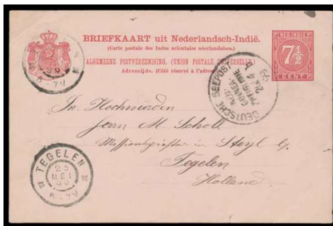
Ex Lot 636

636 CPS 1900-1910 postcards with '.../MARINE-/SCHIFFSPOST' cds No 5, No 7 (2) or No 65 (with roneo'd illustration of a tree kangaroo), and 1899 Dutch Indies 7½c Postal Card with '.../NEU-/GUINEA/ZWEIGLINIE/ b ' cds, condition variable. (5)