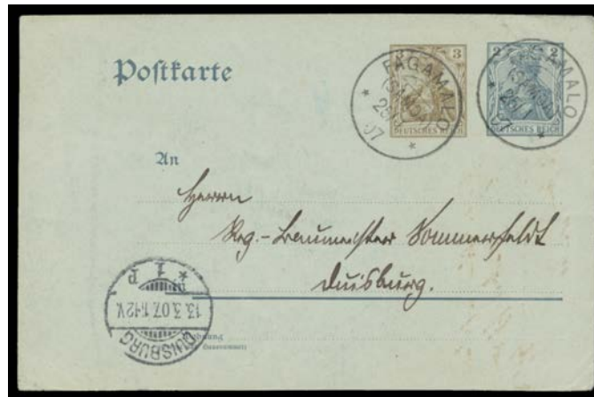
Ex Lot 703

703 PS 1907-08 philatelic usages of Postal Cards with very fine cds of 'FAGAMOLO', 'MULIFANUA' (to Switzerland) & 'SALAILUA' x2, also aged registered cover with 'MULIFANUA' cds & registration label. Scarce. (5)