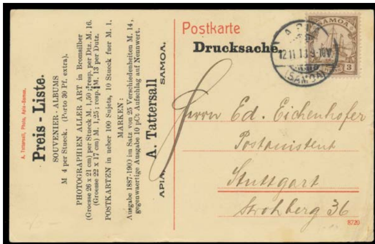
Ex Lot 706

706 C A-IA 1913 Tattersall PPC advertising his PPCs & sent as legitimate Printed Matter with 3pf solo franking, minor blemishes; also Tattersall PPCs "Samoaner Haus im Bau" with 3pf pair overpaying the 5pf postcard rate, & "In den Savaii-See sich ergiessender Lavastrom" to the USA with 10pf. (3)