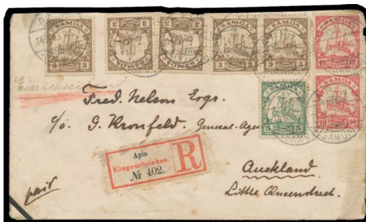
Ex Lot 699

699 CPS - 1901-13 mostly philatelic covers with Yacht frankings including four registered covers with values to 50pf (one from 'MALIFANUA'), etc, commercial items comprise 1901 to California, 1901 to Fiji - badly toned - cancelled on arrival at Suva, 1903 to London & 1903 registered to Auckland, 5pf Postal Card & two PPCs (to New Zealand), condition variable. (16)