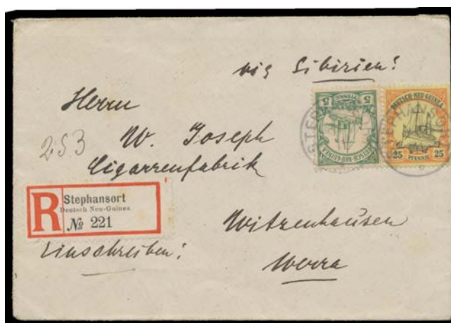
Ex Lot 637

637 C 1902-12 covers with Yacht frankings with commercial items from Herbertshöhe to Bavaria Bohemia & France, and Norddeutscher Lloyd front to Sydney, also registered covers from 'KAEWIENG' & 'STEPHANSORT', etc, condition variable. (10)