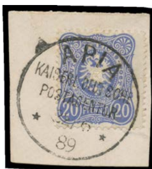
Ex Lot 708

708 D A A1 - 1888 & 1889 two small pieces each with German 20pf tied by very fine strikes of the 28mm 'APIA/KAISERL DEUTSCHE/POSTAGENTUR' cds, and a fair central strike on 50pf block of 4 (small faults). (3)