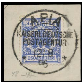
Ex Lot 710

710 D A A1+ - 1896 small piece with German 20pf tied by superb strike of the 30mm 'APIA/KAISERL DEUTSCHE/POSTAGENTUR' cds, and part-strikes tying 2mk purple to a small piece. (2)