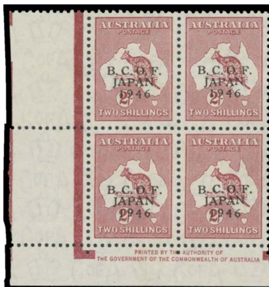
Ex Lot 550

549 P A 1946 Proof Overprints on Plain Paper single impressions of Type One (Thin) in black, in red & in gold, plus Type Two (Thick) in black, Cat $600. 250 T