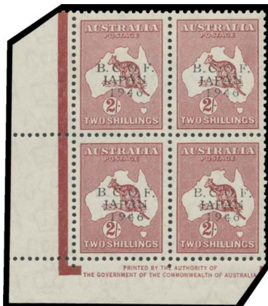
Ex Lot 551

551 */** A - ½d to 2/- lower-left imprint blocks of 4, each with two units unmounted. (6 blocks)