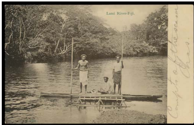
Ex Lot 56