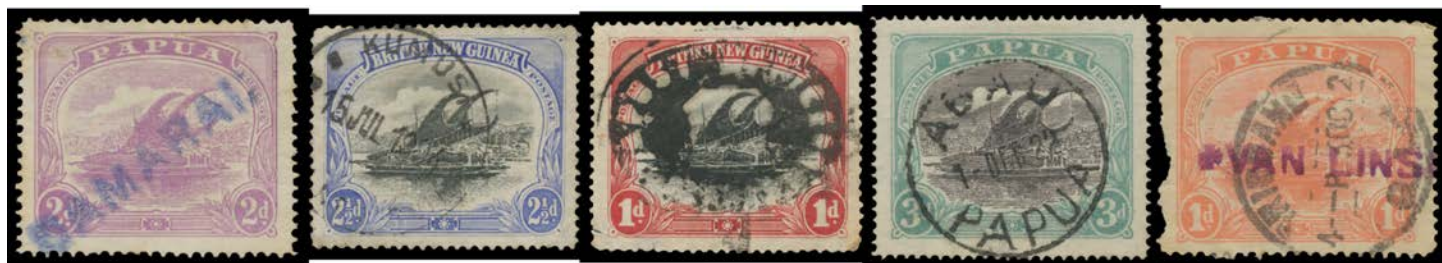
Ex Lot 671

670 PS A/B REGISTRATION ENVELOPES: 1917 4d size G on remaindered NSW stock with Red Star on the Reverse BW #PAP3 & 4d size H2 on grey-blue stock (a little discoloured as usual) #PAP4, unused, Cat $1400. (2) 800