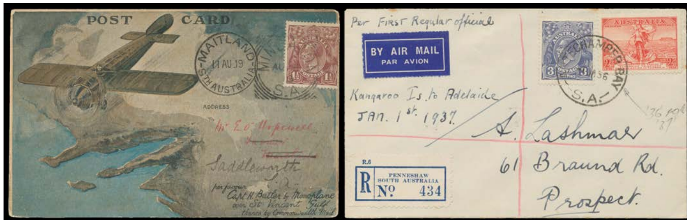
Ex Lot 2229

2229 C A+/B Bundle of mostly 1930s internal flights with intermediates including a few registered, noted 1919 Harry Butler card with HV McKay message (very fine appearance but with toning on the reverse, Cat $650), 1937 Kangaroo Island-Adelaide with 'ANTECHAMBER BAY/1JA36/SA' cds (error for '37') & 1931 (May 19) Clare-UK by Dutch KLM Experimental Flight (registered), also some modern items, generally fine to very fine. (39 items)