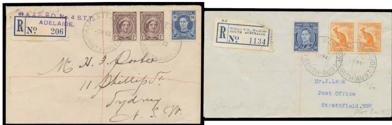
Ex Lot 2234

2234 C A/B - Packet of mostly philatelic covers including registereds from 'RAAF 4 STT ADELAIDE' (rated RRR), 'MIL PO HAMPSTEAD' (RRR), 'RELIEF / 7 ' used at RAAF Mallala, 'RAAF PO MALLALA', 'MIL PO SANDY CREEK' (RRR), 'MIL PO WARRADALE' (R), 'MIL PO WOODSIDE' (RR x2 & with an unrecorded cds) and 'NAVY POST OFFICE/No 1' used at Darwin (commercial), unregistered including 'MIL PO EXHIBITION' BLDG' (RRR), 'RAAF 7400' used at Mallala (RR), some minor toning but a very scarce & desirable lot. (22)