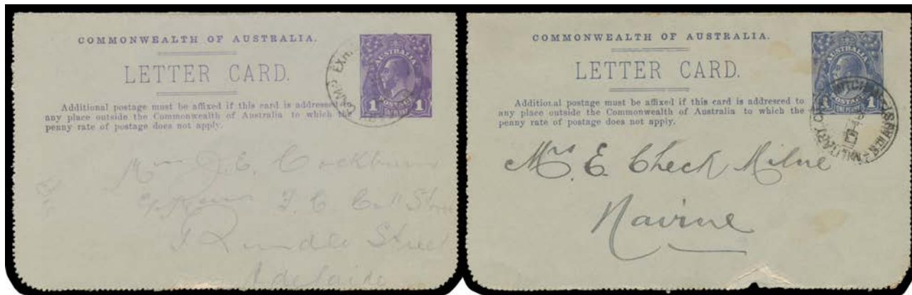
Ex Lot 2232

2232 CPS WORLD WAR I: Rather scruffy group including scenic Letter Card & YMCA envelope both with 'MILITARY CAMP MITCHAM' cds, scenic Letter Card with 'MILITARY CAMP EXHIBITION' cds, 20/1/1920 1d Envelope from 'GAWLER' to a German POW in NSW, lots of inwards mail mostly from the Western Front but also some from Egypt, YMCA PPC headed "Engrs Depot Moore Park/Wireless Squadron" with very fine 'MOORE PARK MILTY CAMP/=NSW=' cds, & POW Envelope with 'LIVERPOOL/NSW' cds, etc, condition very mixed. (100 approx)