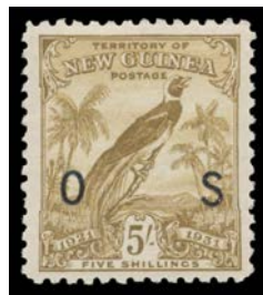
Ex Lot 730