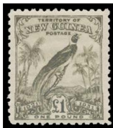
Ex Lot 722