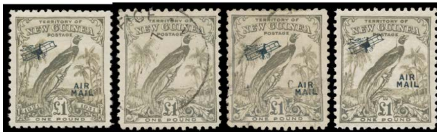
Ex Lot 721