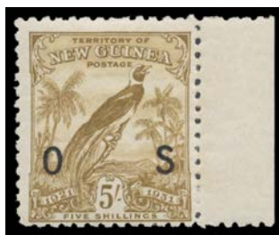
Ex Lot 731