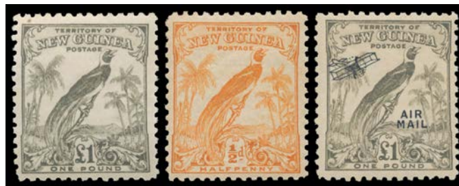
Ex Lot 724