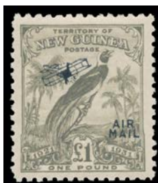
Ex Lot 723