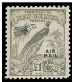
Ex Lot 725