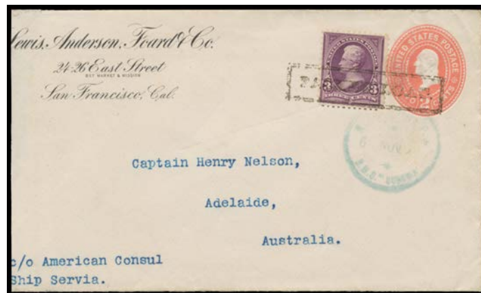
Ex Lot 741