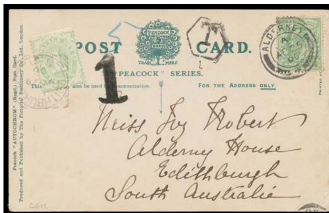
Ex Lot 374