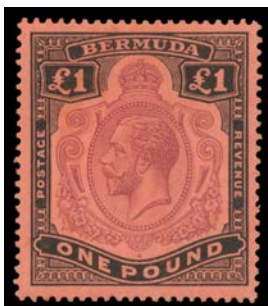
Ex Lot 563

563 *O - 1918-37 KGV Issues mostly mint including MCA 2/- to £1 plus extra 2/6d 4/- & 5/- x2 and a few minor Keyplate varieties, Tercentenary x2 sets of both issues, Jubilee *&U, Pictorials mint x2 sets plus 2d & 6d both shades Imprint Blocks of 4 and a used set, generally fine to very fine, Cat £1700+. (120 approx)