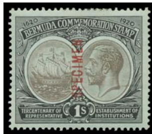
Ex Lot 567

566 * A- - 1918-22 MCA KGV Keyplates 2/- to £1 SG 51b-55 overprinted 'SPECIMEN', variable centring & minor hinge remainders, Cat £900. (6) 500