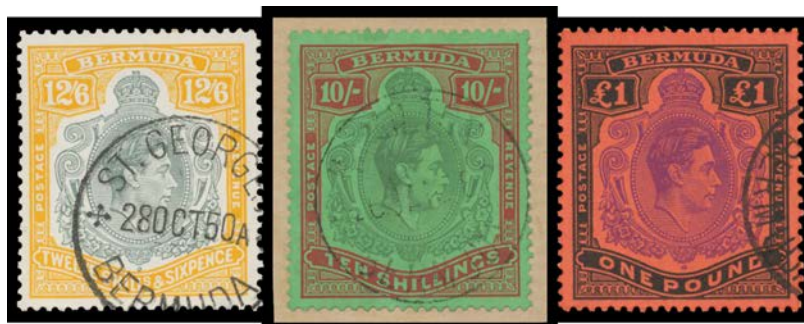
Ex Lot 572

571 * - 1938-53 KGVI Keyplates annotated pages with 2/- x19 including SG 116 x2, Line Perf SG 116b & SG 116f marginal block of 4; 2/6d x12 including Line Perf SG 117a & one with Plate Number '1' ; 5/- x10 including SG 118 118a & Line Perf SG 118b; 10/- x9 including SG 119 119a & Line Perf SG 119b; 12/6d x11 including SG 120a x2 & SG 120e with Plate Number '1' ; and £1 x8 including SG 121 & SG 121e; etc, includes a few minor varieties, the earlier printings with some characteristic tropicalisation, generally well centred & very fine, many we checked are very lightly mounted & a few appear to be unmounted, Cat £6500+. A beautiful array of these vividly coloured stamps, that are among the most popular issues of the Reign. [For this & the following KGVI lots, the identifications are as per Russell Stern's annotated display pages. There are stamps here that don't obviously conform to the Gibbons listings so personal inspection is strongly recommended] (69) 3,000