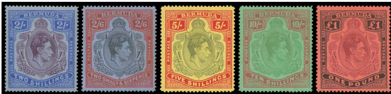
Ex Lot 571

571 * - 1938-53 KGVI Keyplates annotated pages with 2/- x19 including SG 116 x2, Line Perf SG 116b & SG 116f marginal block of 4; 2/6d x12 including Line Perf SG 117a & one with Plate Number '1' ; 5/- x10 including SG 118 118a & Line Perf SG 118b; 10/- x9 including SG 119 119a & Line Perf SG 119b; 12/6d x11 including SG 120a x2 & SG 120e with Plate Number '1' ; and £1 x8 including SG 121 & SG 121e; etc, includes a few minor varieties, the earlier printings with some characteristic tropicalisation, generally well centred & very fine, many we checked are very lightly mounted & a few appear to be unmounted, Cat £6500+. A beautiful array of these vividly coloured stamps, that are among the most popular issues of the Reign. [For this & the following KGVI lots, the identifications are as per Russell Stern's annotated display pages. There are stamps here that don't obviously conform to the Gibbons listings so personal inspection is strongly recommended] (69) 3,000