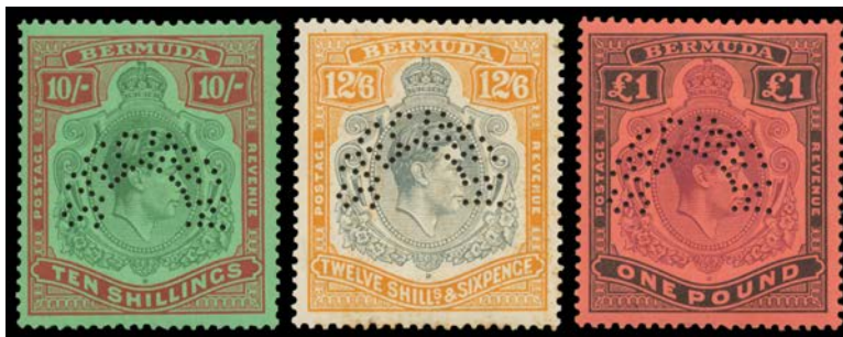
Ex Lot 575