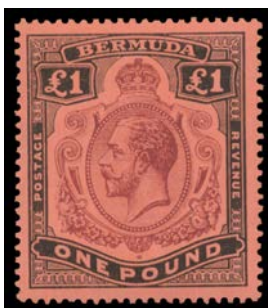
Ex Lot 564

564 * A B1 - 1918-22 MCA KGV Keyplates 2/- to £1 SG 51b-55, well centred & very fresh, Cat £600. (6)