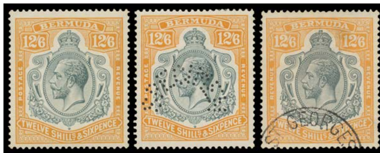
Ex Lot 568

567 * A- - 1920-21 Tercentenary (First Issue) ¼d to 1/- SG 59-67 overprinted 'SPECIMEN', variable centring & minor hinge remainders, Cat £375. (9) 200