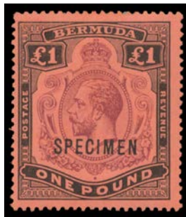
Ex Lot 566

565 * A- - 1918-22 MCA KGV Keyplates 2/- & 4/- both with Broken Crown & Scroll SG 51bb & 52bb, minor hinge remainders, Cat £525. (2) 300