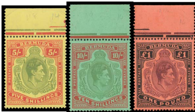
Ex Lot 574

573 * A - 2/- x5, 2/6d x8, 5/- x9, 10/- x4, 12/6d x2 & £1 x4, some characteristic tropicalisation of the gum, mostly lightly to very lightly mounted, unidentified printings so Cat £1100++ as the cheapest variants but significantly better than that. Inspection guaranteed to be rewarded. (32) 400