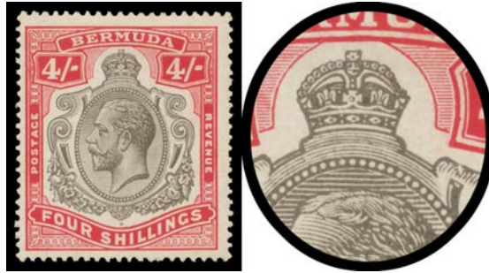
Ex Lot 565

565 * A- - 1918-22 MCA KGV Keyplates 2/- & 4/- both with Broken Crown & Scroll SG 51bb & 52bb, minor hinge remainders, Cat £525. (2) 300