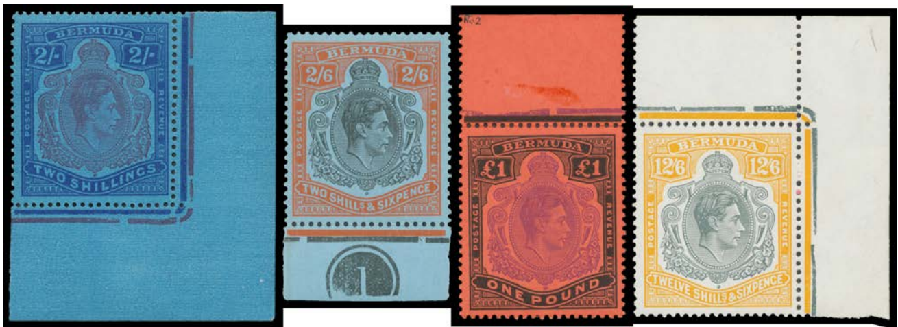
Ex Lot 582

581 ** A C1 - Perf 14 12/6d grey & pale orange SG 120b with Gash in Chin SG 120bcf, unmounted, Cat £2500. 1,500