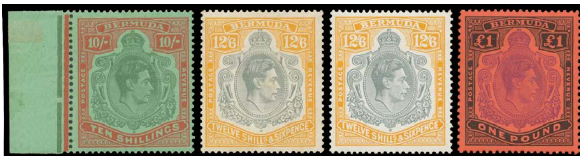
Ex Lot 573

572 F/V - the companion used group including 2/6d SG 117a x2, 10/- SG 119 on small piece, 12/6d Perf 13 x3, £1 SG 121 & 121e, etc, generally very fine, Cat £2400 (not including several with dubious cancels). (58) 1,000