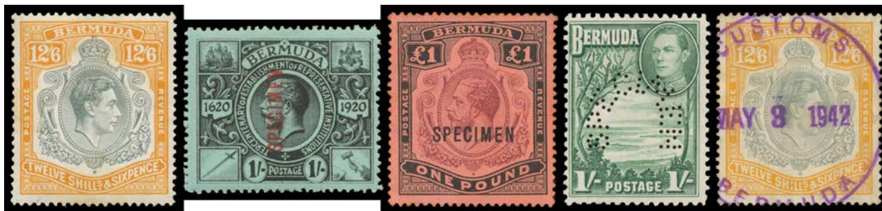
Ex Lot 559

559 **/O BERMUDA: The mostly mint balance of Russell Stern's collection with ranges from all periods to 1970 including KGV Keyplates 2/- x8, 2/6d x6, 4/- & 5/- x4 (one used, with 'PARCEL POST/BERMUDA' cds), KGV Keyplates 2/- x8, 2/6d x10 (one with Plate Number '1' , used), 5/- x5, 10/- x2 & 12/6d x3 plus a used selection to 10/-, some 'SPECIMEN' stamps including KGV £1 (creased), 1921 Tercentenary (Second Issue) set & KGV Pictorials five values to 1/- etc, condition variable. (100s)