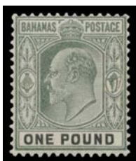
Ex Lot 553

We are pleased to offer the attractive collections of Bahamas and Bermuda formed by Russell Stern from Sydney.