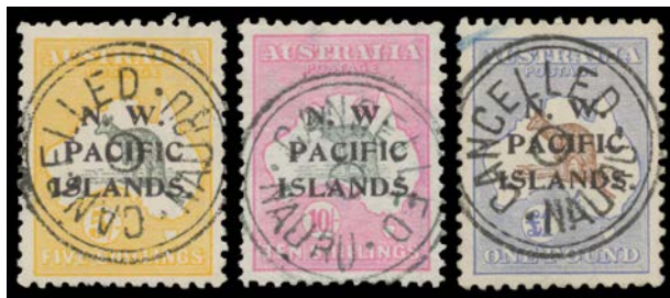
Ex Lot 665