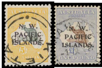
Ex Lot 704