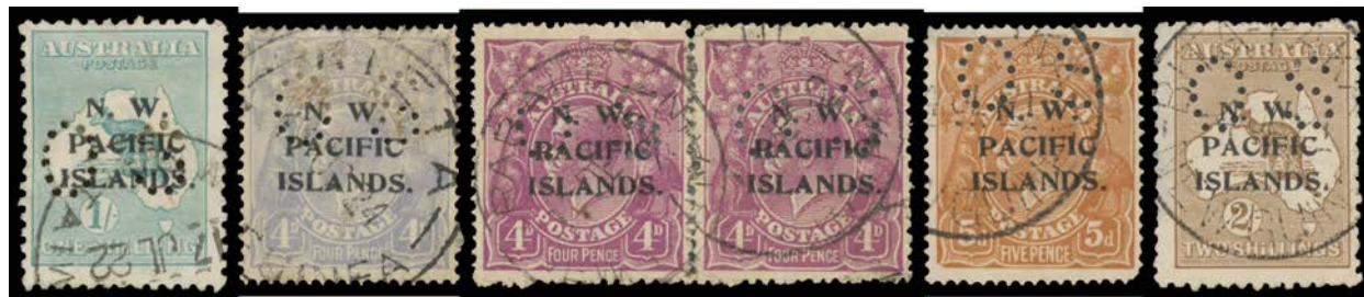
Ex Lot 719

719 O A/B PERFORATED 'OS': Kangaroos 2d 1/- & 2/- and KGV 1d carmine block of 4, 1d rosine, 1d violet, 2d orange, 4d violet rejoined pair, 4d pale ultramarine & 5d ('BITA-JPAKA' cds), a few minor defects, Cat £1500 approximately. A very scarce group. (14)