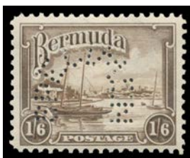
Ex Lot 569

568 * A/A- BERMUDA: 1924-32 Script KGV Keyplates 2/- x3, 2/6d x12 with a good range of shades, 10/- x5 & 12/6d x3 + perf 'SPECIMEN', and Postal Fiscal 12/6d SG F1 with per favor cds, Cat £2000+ (minimum) + SG F1 Cat £1500 with cds dated between February & April 1937. [For the 2/6d group, we recommend personal assessment of the shades] (22) 1,000