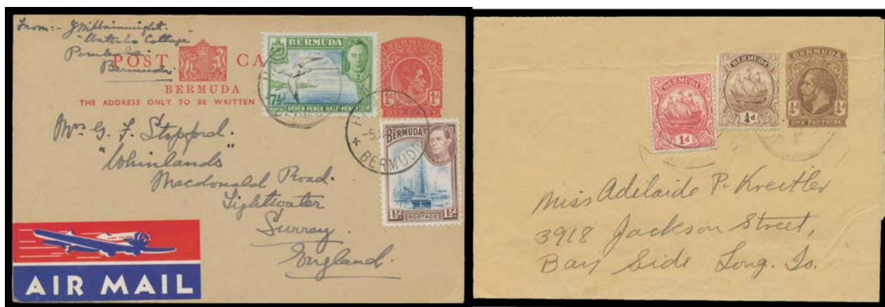
Ex Lot 584

We are pleased to offer the attractive collections of Bahamas and Bermuda formed by Russell Stern from Sydney.