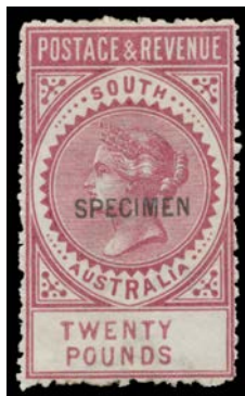
Ex Lot 438

438 * A/B 1886-96 'POSTAGE & REVENUE' Perf 11½-12½ 2/6d to £20 SG 195a-208a reprints (ex £5 brown & £15) all with 12½x2mm 'SPECIMEN' Overprint, some characteristic perf & gum problems, large-part o.g. Ex Ed Williams. (12)