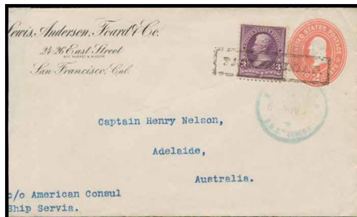
Ex Lot 741