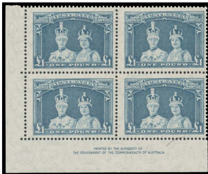
Ex Lot 337