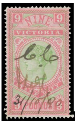
Ex Lot 488

488 O A REVENUES: 1886-96 Fergusson & Mitchell £5 to £9 Bicolours, very fresh with none of the usual pinholes, neat manuscript cancels. (5)