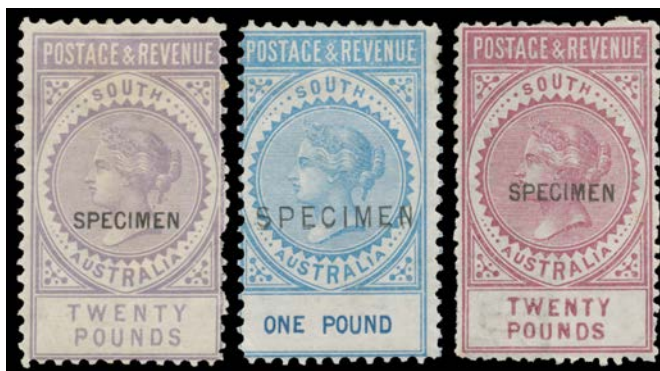
Ex Lot 436