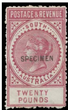
Ex Lot 438