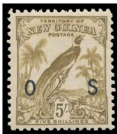
Ex Lot 732

732 ** A/A+ 'OS' OVERPRINTS: 1932-34 Undated Birds 1d to 5/- SG O42-54, generally well centred, very fresh & unmounted, Cat £275 (mounted). (13) 300