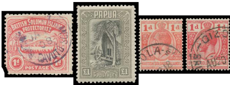
Ex Lot 49

49 *O Pacific Islands with Papua 1932 Pictorials plus ½d 1d & 3d shades, the £1 with a couple of short perfs; and Solomons collection with 1908 'GAVUTU' cds on 1d Large Canoe, 1918 'AOLA' cds on KGV 1d red, Jubilee set mint & used, KGV I Pictorials mint & most values used, Wedding *&U, 1956 QEII Pictorials mint, etc; generally very fine. (160+)