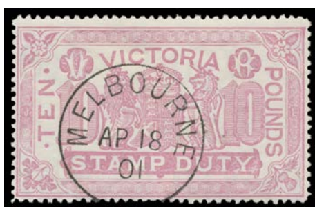
Ex Lot 480

480 V/F A/A+ 1884-96 Large Stamp Duty 3/- drab, 5/- rosine, 6/- apple-green, 10/- blue-green, 15/- brown, £1 orange x2 (one on Yellow Paper), £1/5/- pink, £1/10/- pale olive, £2 blue, 45/- mauve & £10 lilac, all CTO with large-part o.g., Cat £1240+ (without gum). Several are superb! Ex Colonel Harrie Evans: sold for $720 at the Prestige auction of 4/5/2002. [The 6/- 10/- & £1 on Yellow are dated 5DE/00; and the top five denominations are dated AP18/01] (12)