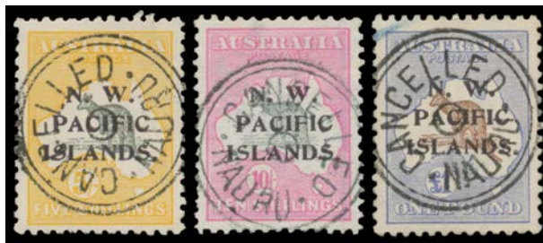
Ex Lot 665

665 G/F A 1915-16 NWPI Overprints simplified Kangaroos 2d to £1 (ex 2½d) plus KGV 1d 4d & 5d all with 'CANCELLED/NAURU' telegraph cancels. A very scarce "set". [See also Lot 707] (12) 500