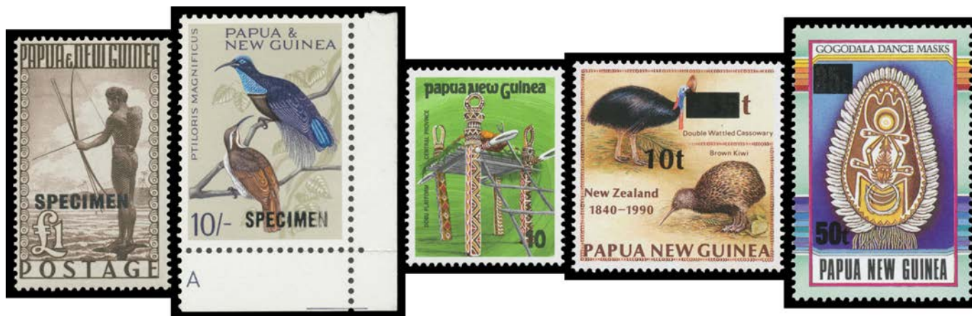
Ex Lot 1150