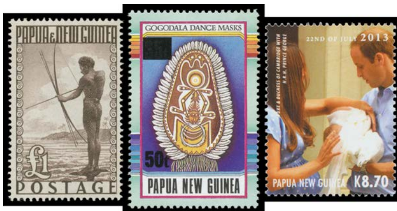
Ex Lot 1147