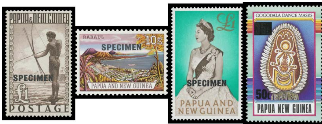
Ex Lot 1149