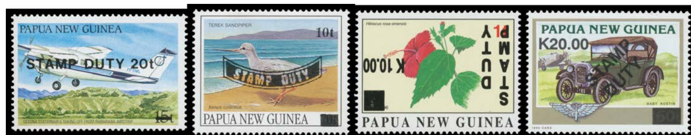
Ex Lot 1167