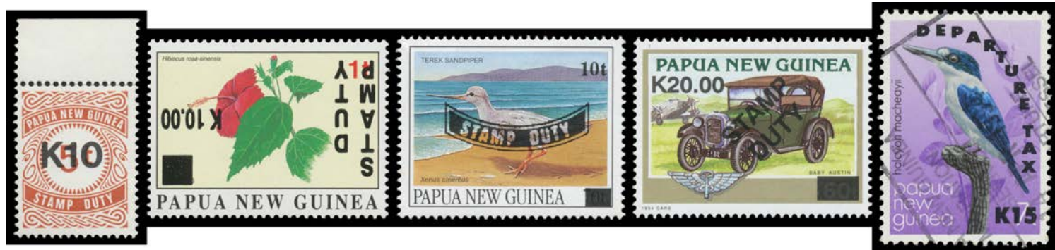
Ex Lot 1166