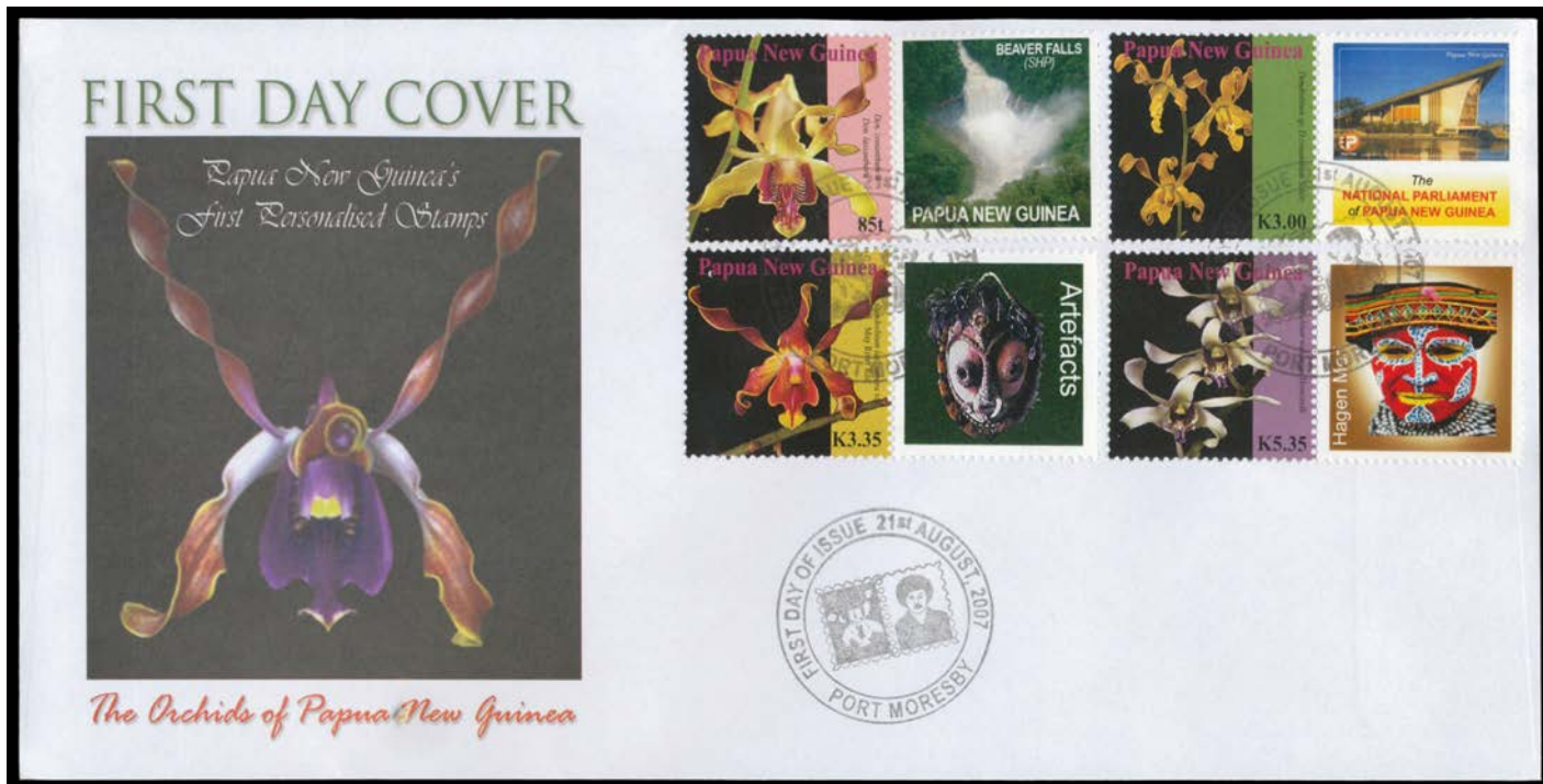
Ex Lot 1163