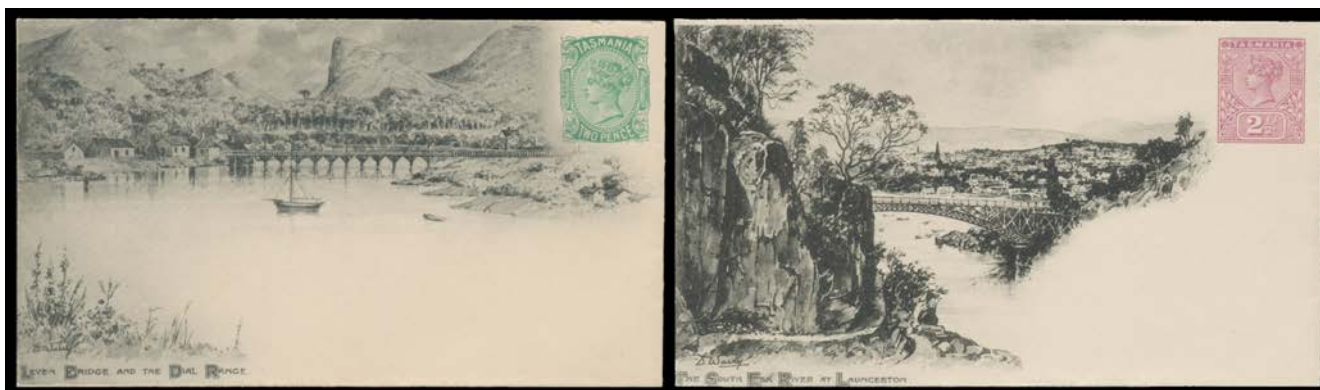
Ex Lot 803