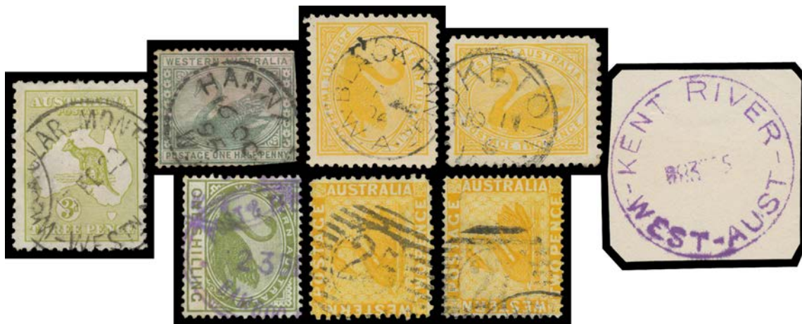
Ex Lot 844

843 C Batch of PPCs with some useful postmarks including 15-bar '17' & 'AUSTRALIND' "tie", 'COOKERNUP' duplex, 'DARDANUP' & 'ISRAELITE BAY', etc, condition variable. (50 approx) 400