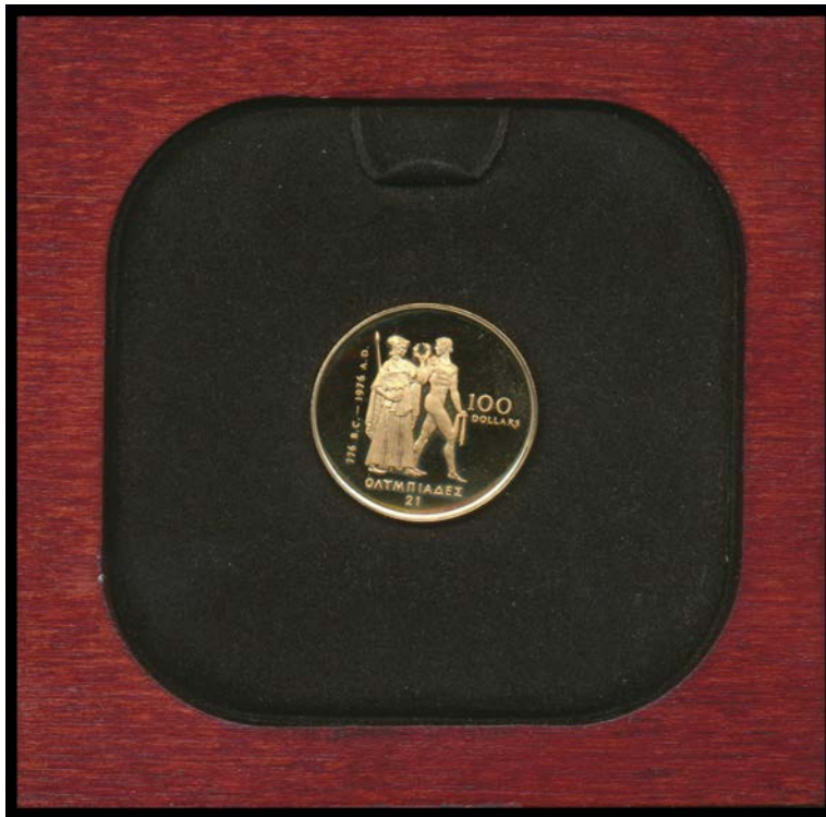
Ex Lot 205

204 $ A+ CANADA: 1973-1976 Montreal Olympics Proof Coin Collection, seven sets of four coins ($5 x2 & $10 x2) in separate presentation cases plus walnut display rack, all in original packaging as delivered. (28 coins) 400