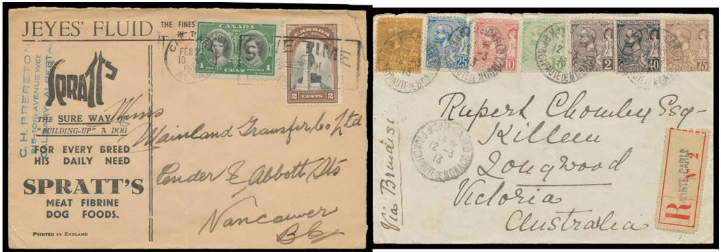
Ex Lot 510