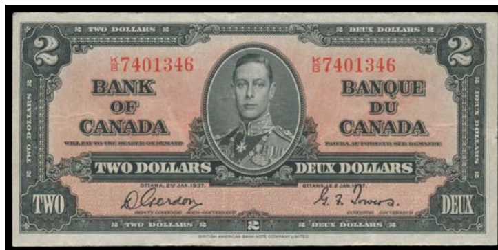
Ex Lot 227

227 $ - 1914-2005 selection on Hagners with 1914 $2 Pick #30b gVG, 1923 25c VG, 1937 $1 Pick #58d (2), $2 Pick #59b VF, QEII issues Unc to $20 including some consecutive pairs. (23) 500