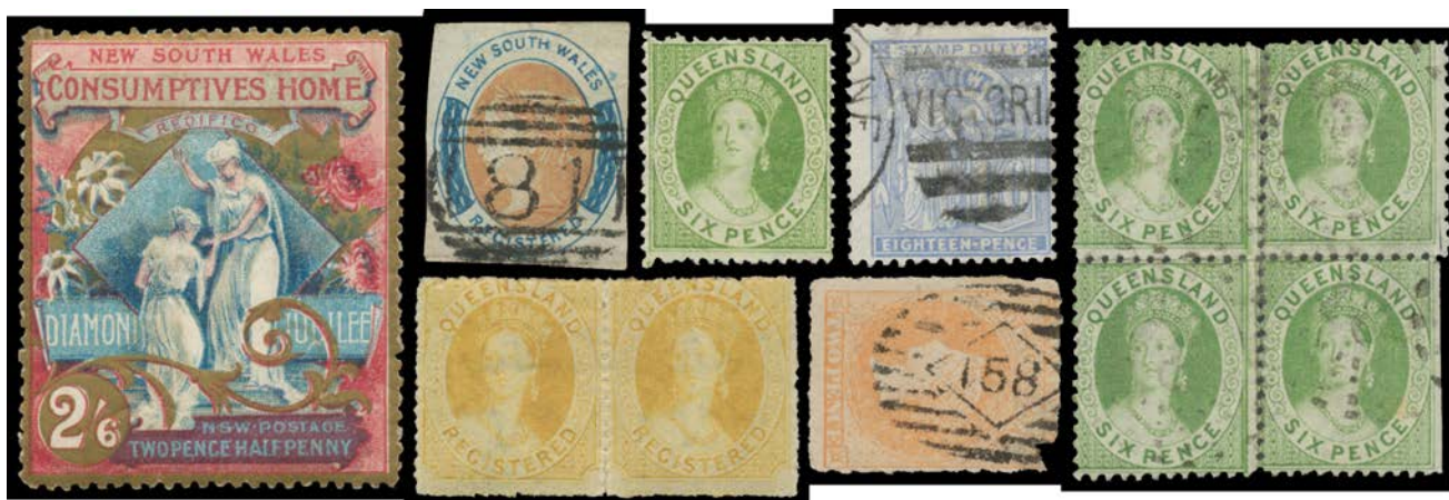
Ex Lot 736

736 *O Untidy collection but lots of little gems including NSW Imperf 'REGISTERED' with superb BN '81' of Warwick (Moreton Bay District), 20/- Governors, Charity duo, 'OS' to 5/- Coin & 5/- Map; Queensland 'REGISTERED' SG 20 mint pair, 6d SG 69 unused & Crown/Q 6d SG 92 superb used block of 4; South Australia 2d with superb Diamond Numeral '158' (rated RR); Tasmania Tablets mint to 5/- & DLR Pictorials and Crown/A 6d used strip of 3; Victoria earlys & 1/6d blue; Western Australia earlys & later to 10/-, etc, condition variable but many are fine to very fine. (few 100)