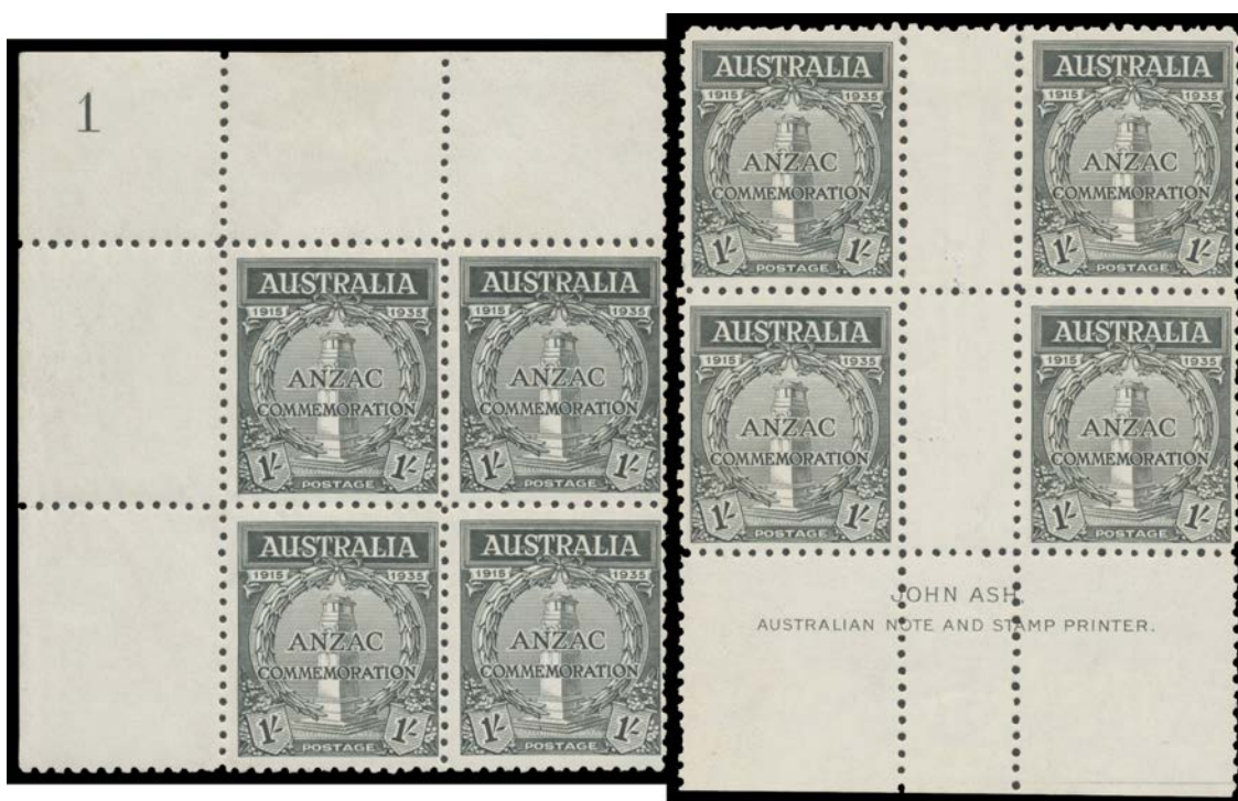
Ex Lot 488

488 ** A ONE SHILLING: 1/- black Plate Number '1' & '2' upper-left blocks of 4 BW #165z & za, plus John Ash Imprint block of 4 #165zb (one unit very lightly mounted), unmounted, Cat $1500. The ACSC states "Imprint blocks are relatively scarce because a proportion of the issue was made to post office in half-sheets divided along the gutter, thus separating the imprint". (3 blocks)