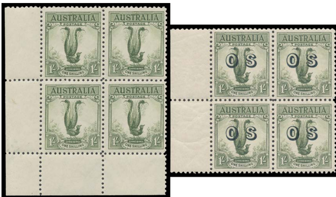
Ex Lot 438