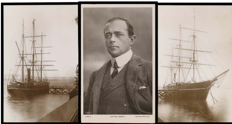
Ex Lot 460