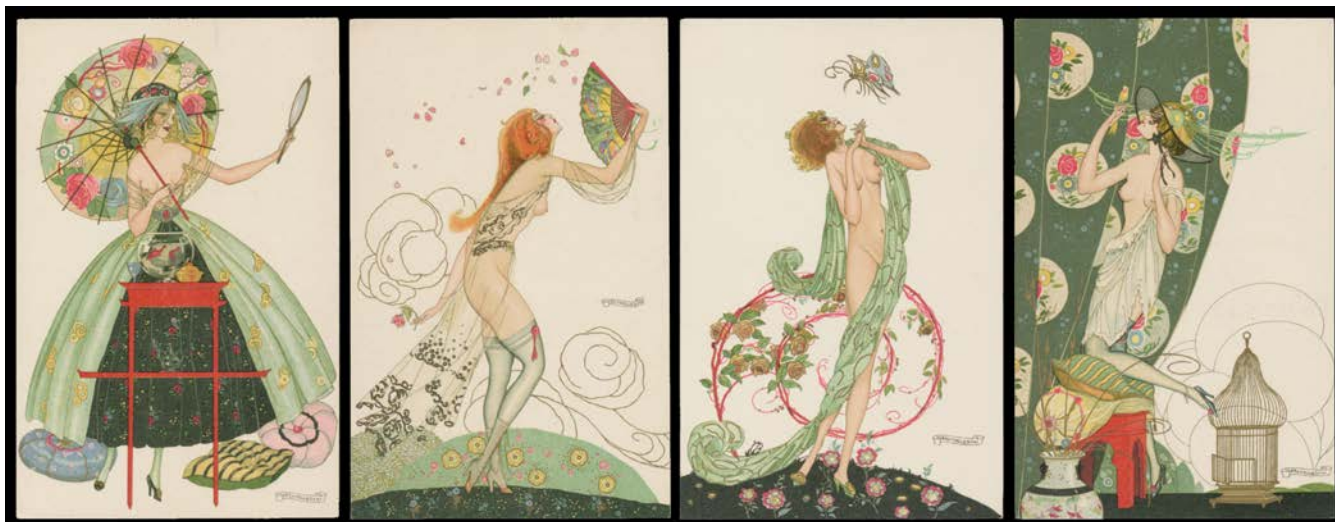
Ex Lot 510

510 C A+ - U Brunelleschi: R et Cie (Serie 31) Glamorous Ladies in Various States of Undress set (?) of 6, unused, Cat £110 each. Quite exceptional & superb! Ex Keith Harrison. (6)