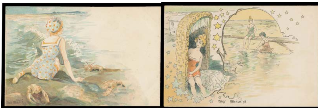
Ex Lot 506

506 C A+ ART NOUVEAU - Jack Abeille: 1898 Bathing Costumes x3 (two are Swiss editions), and 1899 Bathing Costumes x3, all with Undivided Backs, unused, Cat £60 each. Superb! Ex Keith Harrison. [From 1898, Jack Abeille was one of the first established French artists to design postcards] (7)