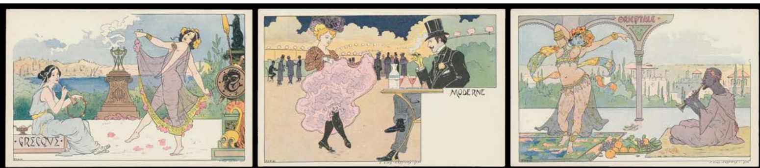
Ex Lot 511

511 C A+ - E Louis Lessieux: 1900 Dancing Through the Ages set of 6 with Undivided Backs, a little nudity, unused, undercatalogued at £40 each. Superb! Ex Keith Harrison. (6)