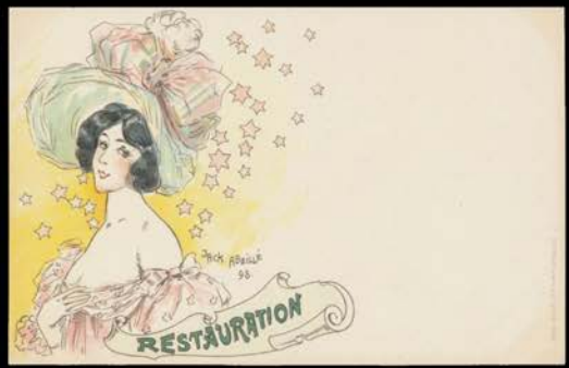
Ex Lot 507

507 C A-/A+ - 1898 JWH a B Fashion Through the Ages set (?) of 7 with Undivided Backs, unused. Undercatalogued at £60 each. Ex Keith Harrison. (7)