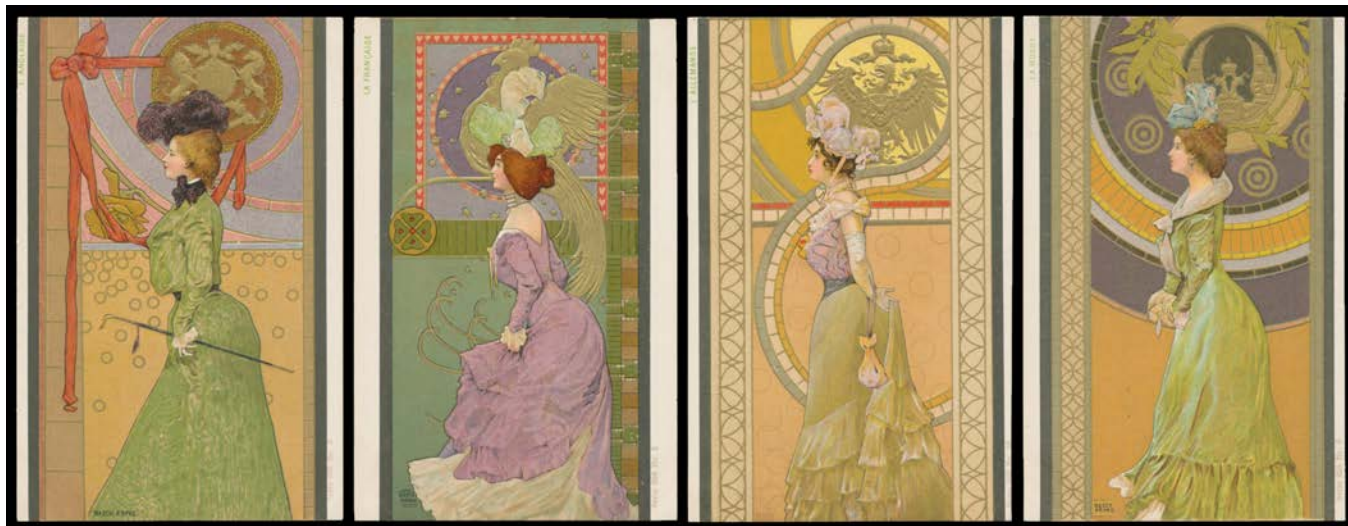
Ex Lot 509

509 C A/A+ - Basch Arpad: c.1900 "National Women" (Very Fashionable Ladies with their National Emblems) set of 10 embossed designs with gold highlights & Undivided Backs, unused. Très magnifique! Ex Keith Harrison. (10)