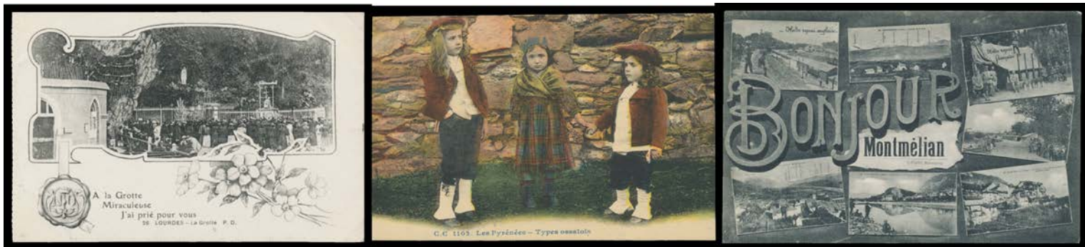
Ex Lot 503