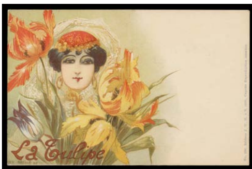
Ex Lot 508

508 C A - 1899 Caprice Flowers with Undivided Back "La Tulipe" & "La Violette", unused. Undercatalogued at £60 each. Ex Keith Harrison. (2)