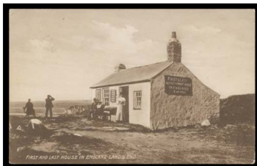
Ex Lot 564