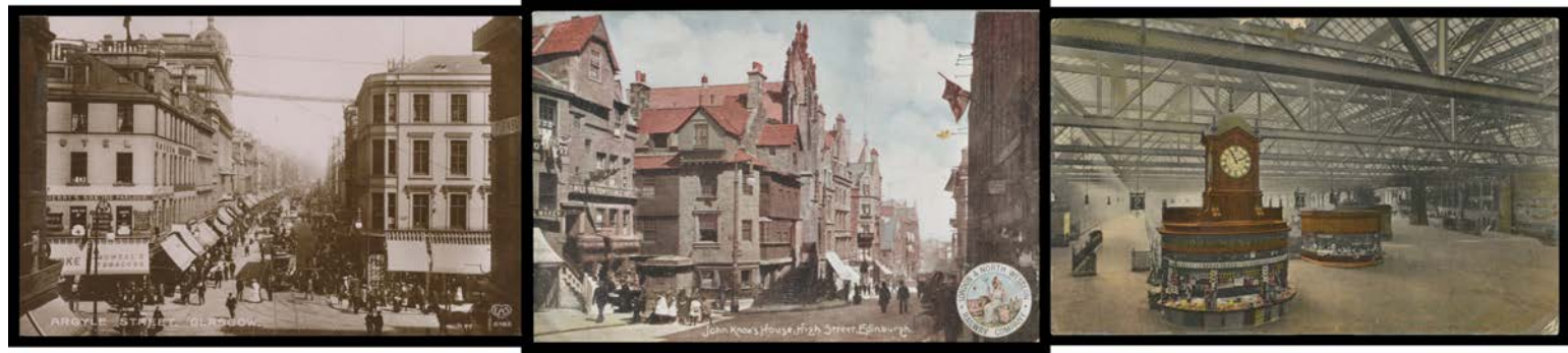
Ex Lot 565

565 C SCOTLAND: Mostly unused topographicals including JWB Commercial Series x19, Rapco "Up the Clyde" set of 6, Milton Glazette Tartan Borders set of 12 & L&NW Railway "Scotland" set of 6, etc, a few useful postmarks, generally fine to very fine & most of those mentioned are superb. Ex Keith Harrison. (70 approx)