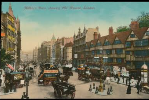
Ex Lot 562