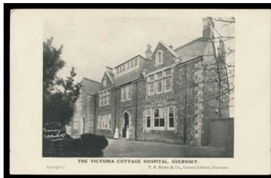
Ex Lot 567

567 C OFFSHORE ISLANDS: Mounted collection with strength in Jersey, Guernsey, Isle of Man and Isle of Wight but many other islands noted including Sark, Scilly Isles, Lundy & Scottish Islands, many better views/subjects, condition variable but generally fine to very fine. Ex Bronte Watts. [This collection includes some modern tourism cards that are not included in the count or valuation] (110 approx)