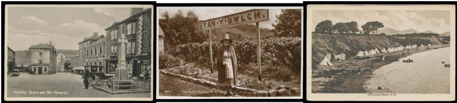
Ex Lot 566

566 C WALES: Fascinating collection of mostly topographicals - no Cardiff or Pontefract - with lots of variety including an excellent group of multi-views in various styles x27, Peacock Brand beautiful multicoloured cards x7, Railway Company cards x20, real photo types x30+, a few lovely artist cards, etc, some Welsh postmark interest, many unused, generally fine to very fine. Ex Keith Harrison. (140 approx)