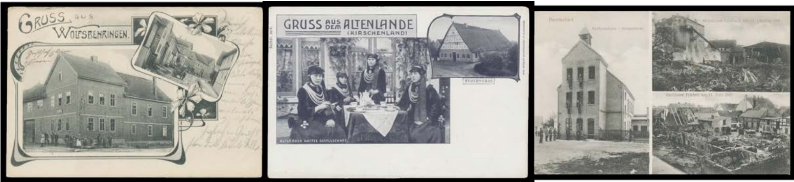
Ex Lot 526

526 C Box of topographicals with more than half from what became East Germany, a range of Undivided Backs with Gruss aus types including chromolithos, alpine hotels, a beautiful selection of Regional Costumes, 1902 Dusseldorf Exhibition, 1906-07 Fire Damage in Bentschen, a few advertising cards & real photo types etc, postmark interest but mostly unused & generally fine to very fine. Ex Keith Harrison . (120 approx)