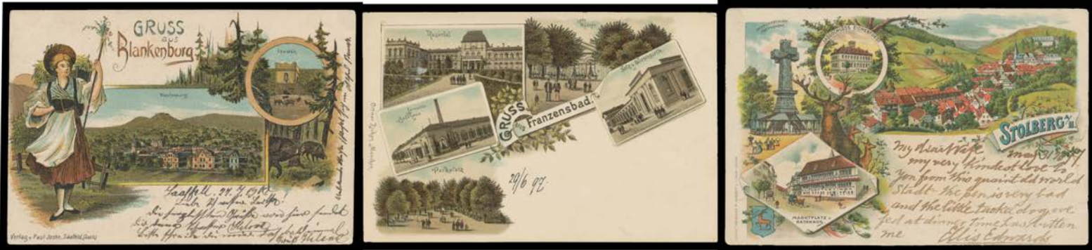
Ex Lot 524

524 C Range of gorgeous chromolitho Gruss aus types for major cities but also for Assmanshausen, Mannheim, Giessen, Franzensbad, Stilberg, Bad Harzburg, Neuwied, Magdeburg, Blankenburg, Marienbad & Alsterpark bei Hamburg, also for Prague & Vienna, some faults but all presentable & many are fine to very fine, three are unused. Ex Bronte Watts . Beautiful material. (19)