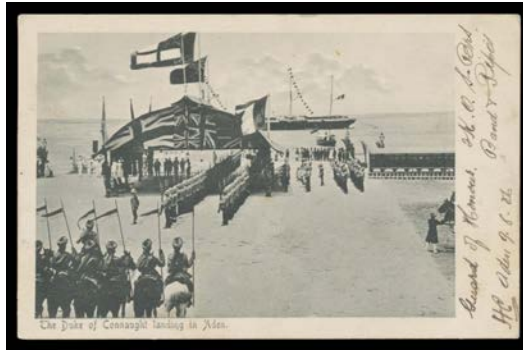
Ex Lot 715