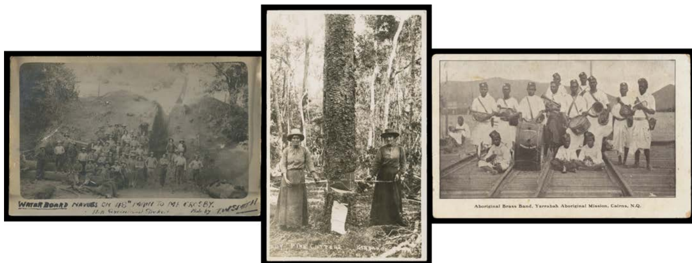
Ex Lot 360