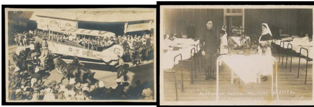
Ex Lot 359

359 C Group of historical real photos with WWI "Portion of Ward Military Hospital Enoggera", a terrific but unidentified Military Parade, 1926 Pupils at Coorparoo School, 1928 ABC Trans-Pacific Flight with photos of Kingsford Smith & Ulm with facsimile signatures, etc, also photographs including 1928 Bert Hinkler's arrival at Bundaberg & his plane being paraded thru Brisbane, Carlton VFL Footballers in Queensland x3, etc, generally fine to very fine, also two Stereo Cards of Queensland Floods (one almost fine, the other poor). Ex Coo-ee Picture Library. (22)