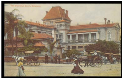
Ex Lot 358

358 C Large album with strong Brisbane including many of the river & various bridges, a few suburban, provincial towns etc, many are Sidues types, also 1915 Panama-Pacific Exposition "Brisbane from the Observatory", some novelty types with fold-out views & a group of small photographs, condition variable. Ex Aldo Paladin. (140 approx)