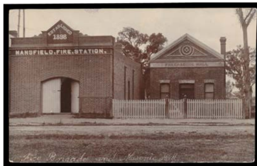
Ex Lot 446

445 C A+ ADVERTISING: c.1900 Troedel & Co advertising card for Melbourne's Grand Hotel (now the Windsor ) with four small illustrations in brown , unused. Very early & rare. Superb! 100