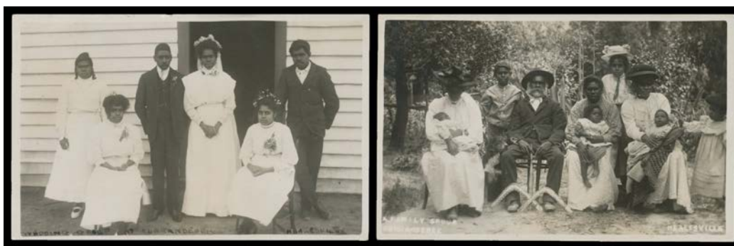
Ex Lot 444