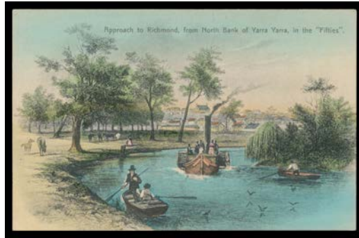
Ex Lot 438

438 C - (c.) S T Gill divided-back artist cards "Victoria in the fifties" - the 1850s - including Ballaarat and Melbourne Post Offices, Market Square Geelong, University of Melbourne, Queens Wharf, paddle steamer on the Yarra etc, condition varied but generally fine to very fine, all but two are unused. (12) 300