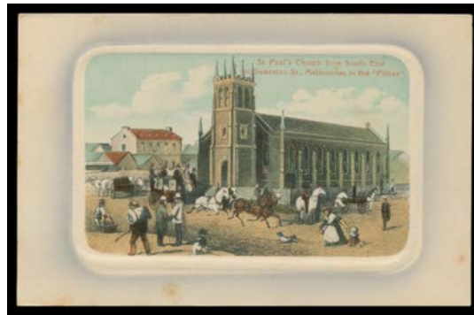
Ex Lot 439

438 C - (c.) S T Gill divided-back artist cards "Victoria in the fifties" - the 1850s - including Ballaarat and Melbourne Post Offices, Market Square Geelong, University of Melbourne, Queens Wharf, paddle steamer on the Yarra etc, condition varied but generally fine to very fine, all but two are unused. (12) 300